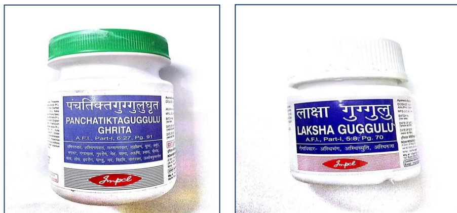
Figure no. 1:- Picture of medicines used in this case study.

In Vasti we are saying patient to lie in the left lateral position. We give Snehana and Swedana on